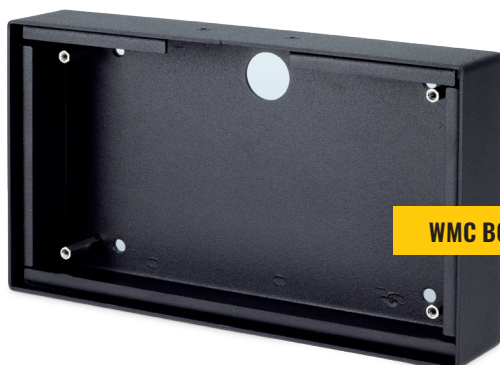
WMC BOX W